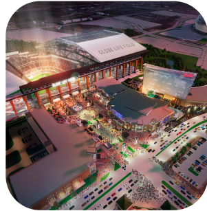
GLOBE LIFE FIELD