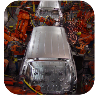
ARLINGTON AUTOMOTIVE LOGISTICS CENTER